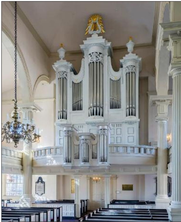
Fisk Op. 150, 3 man/49 stops/44 voices